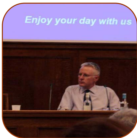
Mr. Norman Lamb MP – LibDem Shadow Minister for Health – at the 2007 IIME International ME/CFS Conference

conferences and this has led to far more awareness of the need for change and new initiatives being planned. Interestingly, we also had similar comments from healthcare staff and from researchers who attended the conferences. Both conferences were CPD accredited and were attended by delegates and researchers from a dozen countries – testifying to the desire for knowledge about the illness as well as concern that more needs to be done.