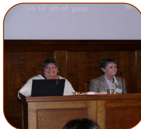
Representatives from the Norwegian ME Association at the London conference

We hope to publish our Journal more frequently and will continue to offer our newsletter -both available for free from our web site. We hope the Journal of IIME will also continue to assist in this area by providing a platform, as does the IIME conference, for biomedical researchers and clinicians to provide details of their research and