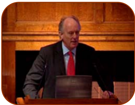
Dr. Ian Gibson MP – speaking at the Invest in ME International ME/CFS Conference

The work performed by invest in ME is entirely voluntary. We have no chief executives or other paid staff. Any income we receive from donations or sales of educational material is used to pay for the production of our conferences, DVDs, booklets and web site and in funding new ideas to campaign for proper treatment for people with ME/CFS and their families.